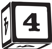
quatre - four