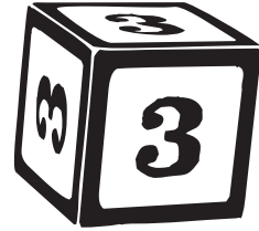
trois - three