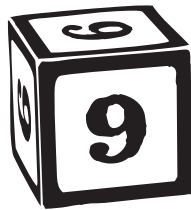
neuf - nine