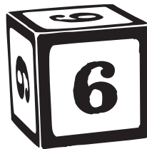
six - six