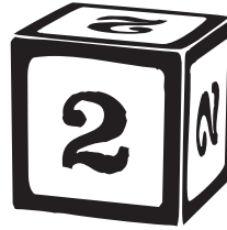
deux - two