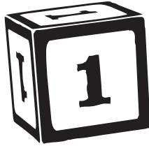
un - one