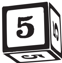
cinq - five