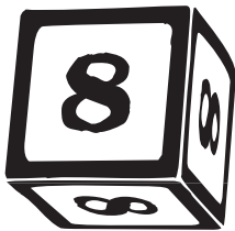
huit - eight